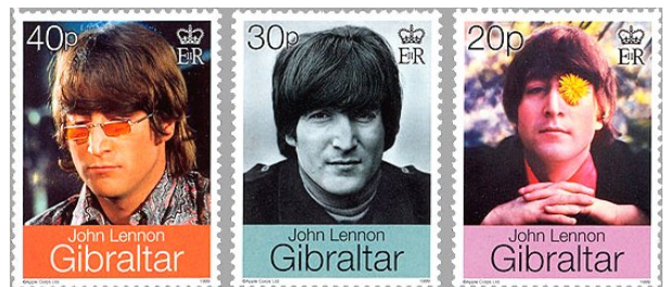
1999 GIBRALTAR (Scott #804 - 803 -802)