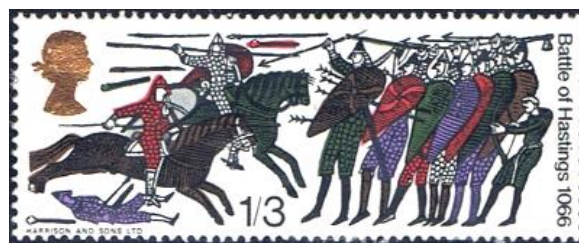
1966 GREAT BRITAIN (Scott. #477 or #477p)