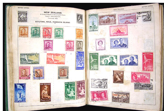
THE NEW ZEALAND PAGES