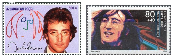
1995 AZERBAIJAN (#546)