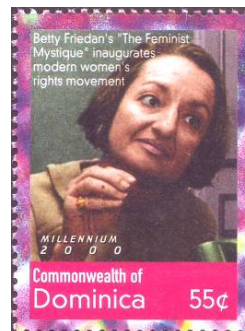
2000 DOMINICA – BETTY FRIEDAN (Scott #2251f)